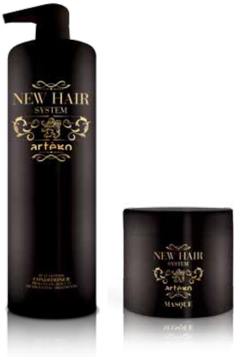
TABLE OF PRODUCTS FOR SALOON TREATMENTS